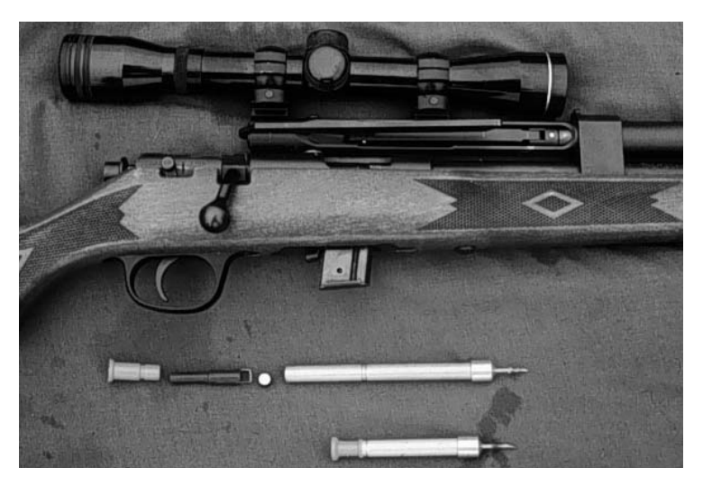
Figure 20. Dart rifle used for delivery of antifertility agents, vaccines, and immobilizing drugs