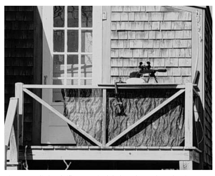
Figure 17. Blind and rifle on a raised deck used as a sharp-shooting station

Several communities have employed trained, experienced personnel to lethally remove deer through sharpshooting (Figure 17) with considerable success (Deblinger et al. 1995, Drummond 1995, Jones and Witham 1995, Stradtmann et al. 1995, Ver Steeg et al. 1995, Butfiloski et al. 1997, DeNicola et al. 1997c). A variety of techniques can be used in sharp-