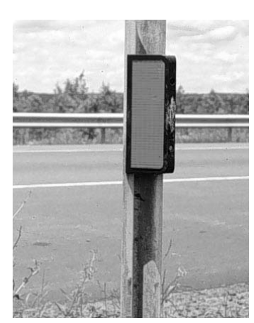
Figure 13. It is not clear that roadside reflectors will consistently reduce deer-vehicle accidents.