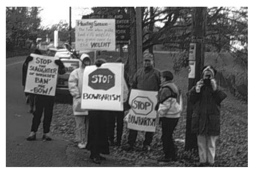
Figure 5. Animal activist groups may oppose controlled hunts, sharp-shooting programs, and other lethal forms of deer removal.

forces and similar transactional approaches (Chase et al. 2000, Curtis et al. 2000a). Communities are now sharing not only the decision-making authority, but also the cost and responsibility for deer management with state and local government agencies under a variety of co-management scenarios. The community scale is appropriate as deer impacts are often recognized by neighborhood groups, and the need for management becomes a local issue. In addition, the success or failure of management actions can be perceived most readily by stakeholders at the community level. Outcomes of co-management are usually perceived as more appropriate, efficient, and equitable than more authoritative wildlife management approaches. Although co-management requires substantial time and effort, this strategy may result in greater stakeholder investment in and satisfaction with deer management.