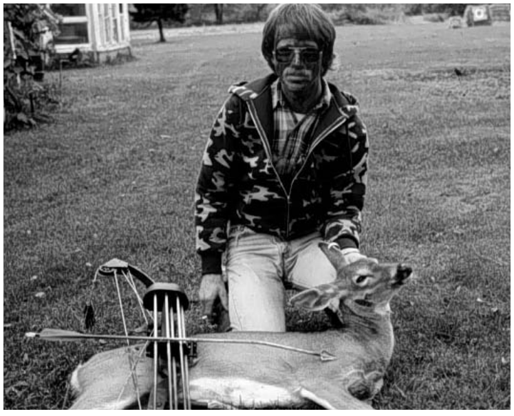
Figure 18. Bowhunters can remove deer from suburban locations where firearm hunts are impractical.

The potential for intervention and/or interference by activist groups is often high when using hunters to manage locally overabundant deer populations. Thus,