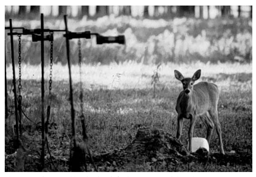
Figure 16. Rocket net positioned and ready for deer capture at a bait station

If capture and translocation is selected as the most appropriate management option, the following recommendations will minimize stress and subsequent capture myopathy during handling procedures. Only experienced personnel should be involved in deer handling or in the immediate area of the capture site. When physically restraining deer (i.e., net guns, drop nets, rocket nets, Clover traps) it may be advantageous to sedate each animal while extracting them