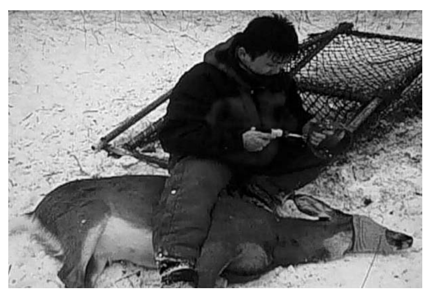
Figure 15. Using netted cages (Clover traps) for capture of deer

With any technique, the cost per deer handled will increase as the proportion of the population removed or treated increases (Rudolph et al. 2000). High costs associated with diminishing returns may prevent achieving population goals with some techniques. Deer learn to avoid threatening situations, and the use of a variety of methods to capture or kill deer can help maintain program efficiency.