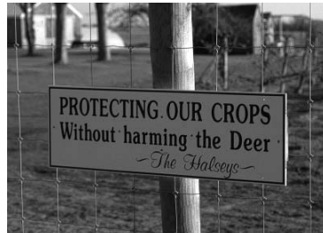
Figure 10. Woven-wire fences are the most effective way to protect large areas (>50 acres) of high value crops.