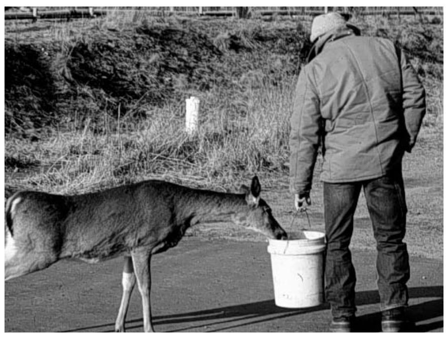
Figure 4. Feeding deer increases the potential for conflicts by making deer less wary of people.

White-tailed deer are extremely adaptable, both in habitat and diet selection. Deer are an edge species, faring well in transitional areas between forests, agriculture, grasslands, and even suburban landscapes. Forests, thickets, and grasslands provide deer with protective cover and natural foods, and agricultural fields can contribute abundant, high-quality forage. The diets of white-tailed deer often depend on the