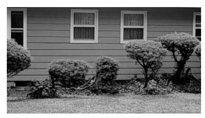
Figure 1. Browsing damage caused by repeated deer feeding on ornamental shrubs.

tors. Homeowners may consider it a nuisance when deer consume garden and landscape plantings (Figure 1). More importantly, an overabundance of deer may cause significant economic losses associated with decreased crops, vehicle collisions, or Lyme disease. Deer also affect forest ecology by feeding on preferred plants and altering the biodiversity in parks and natural woodlands. Human safety can be compromised because increases in deer-vehicle collisions are positively correlated with greater deer abundance (Blouch 1984, Etter et al. In press). For example from 1984 to 1994, as the deer population climbed in the community of Bellvue in Sarpy County, Nebraska, the number of deer-vehicle collisions in that county increased 325 percent (Hygnstrom and VerCauteren 1999). Conover et al. (1995) estimated that more than 1 million deer-vehicle collisions occur annually in the United States, and that annual vehicle repair costs from those accidents exceeded $1.1 billion. They further estimated that each year 29,000 human injuries and 211 human deaths occur as a result of deervehicle collisions. Although these numbers are low compared with other sources of human fatalities, they are of concern.