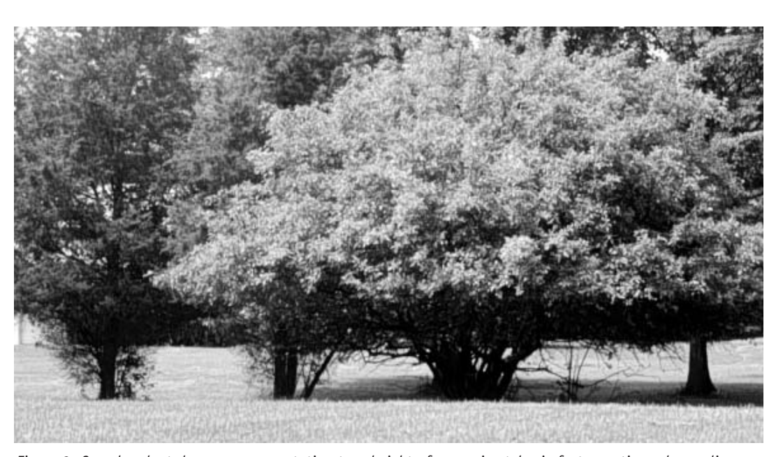
Figure 3. Overabundant deer remove vegetation to a height of approximately six feet, creating a browseline.

Agricultural producers have indicated that deer cause more damage than other wildlife species (Conover and Decker 1991, Conover 1994, Wywialowski 1994). Agricultural damage by deer was greatest in the northeastern and northcentral United States, with at least 41 percent of producers reporting damage (Wywialowski 1994). Conover (1997) conservatively estimated annual deer damage to agriculture at $100 million.