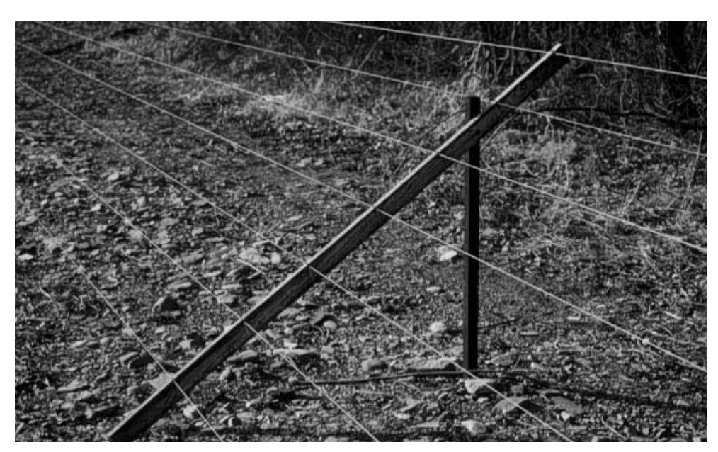
Figure 11. Deer have poor depth perception and will avoid areas protected by electrified, slanted-wire fences.

Multistrand, electrified, high-tensile, smooth-wire fences consist of several individual wires fastened to braced wooden assemblies, with wires tightened to 150 to 250 pounds of tension (McAninch et al. 1983, Palmer et al. 1985). Sturdy, well-braced corner and