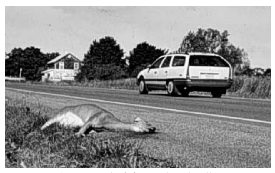
Figure 12. As deer densities increase in suburban areas, deer-vehicle collisions are occuring more frequently.

Wildlife warning whistles (deer whistles) attached to cars have been used in an attempt to reduce deervehicle collisions. These whistles operate at frequencies of 16 to 20 kHz and are intended to warn animals of approaching vehicles. There is no research,