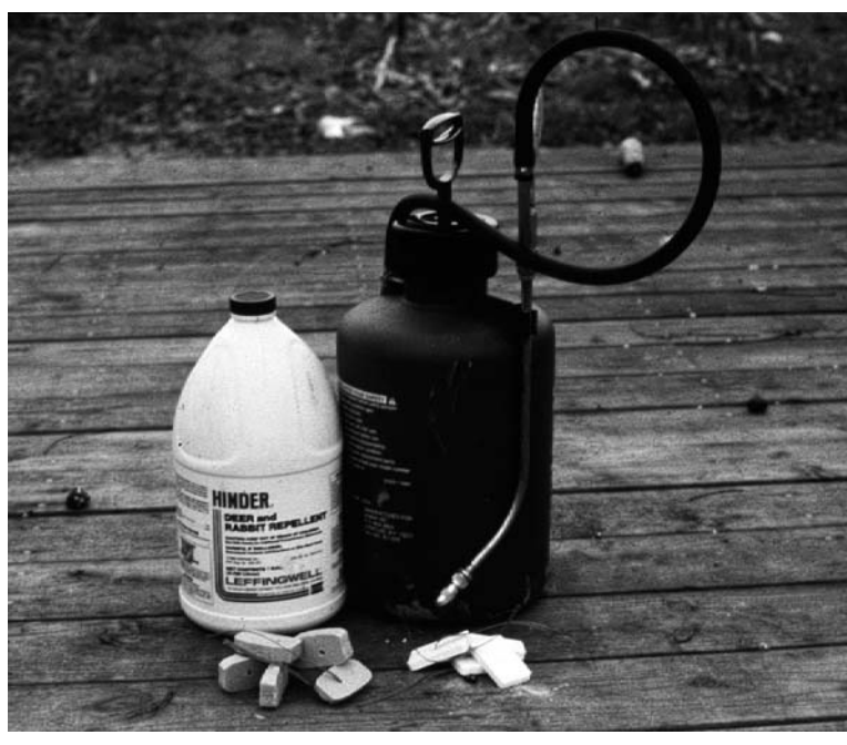
Figure 8. Several commercial repellents may reduce feeding damage for five or more weeks depending on deer foraging pressure and density.

Putrescent whole egg solids are the active ingredient in several odor-based, fear-inducing repellents (e.g., Deer-Away, Deer-Off, Deer Stopper, Big Game Repellent) that have been shown to be effective in