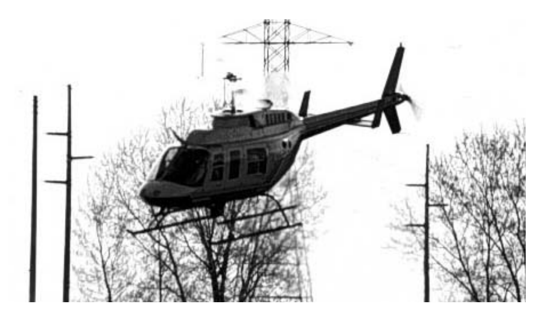
Figure 6. Helicopter surveys can be used to estimate deer abundance in areas with few conifers and four or more inches of snow cover.

To complement population estimates, the physical condition, mortality, and reproductive rates for deer should be monitored regularly to more accurately model deer populations over time. In the absence of population estimates, population indices (e.g., pelletgroup counts, numbers of complaints or conflicts, etc.) may suffice as indicators of relative changes in deer abundance.