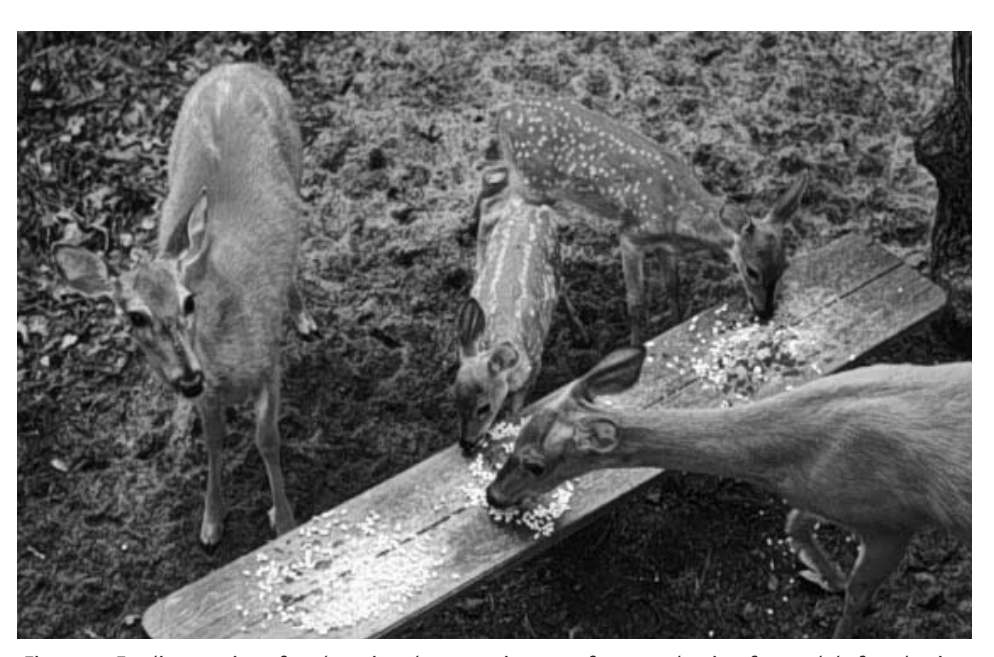
Figure 7. Feeding stations for observing deer may increase fawn production from adult females in good condition.

Repellents have traditionally been classified as odoror taste-based products. Examples of odor-based repellents include products containing rotten eggs, soap, predator urine, blood meal, and other animal parts. Typically, these repellents are poured onto absorbent cloth or placed in a bag and suspended above the ground at densities of up to 1,150 bags/acre (Conover