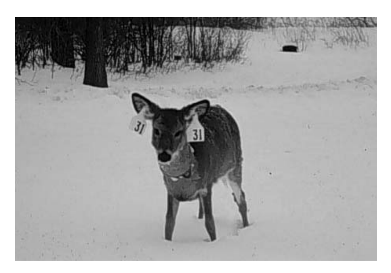
Figure 19. Cattle ear tags and radio collars are used to individually mark deer that are included in a research project.

The FDA has concerns about the safety of consuming deer treated with experimental drugs and currently requires that all treated, free-ranging deer be marked with warning tags (Figure 19) that stipulate consumption restrictions. It is not clear if or when FDA restrictions on consumption of deer meat treated with experimental drugs will be modified. In addition, fertility control agents are usually delivered to deer using either dart rifles or biobullets. Restrictions on firearms discharge in suburban areas often limits practical delivery of drugs to free-ranging deer. Consequently, there are many aspects of the regulatory and commercialization process and delivery systems that still need to be developed before contraceptive vaccines can be a viable management alternative for communities with overabundant deer herds.