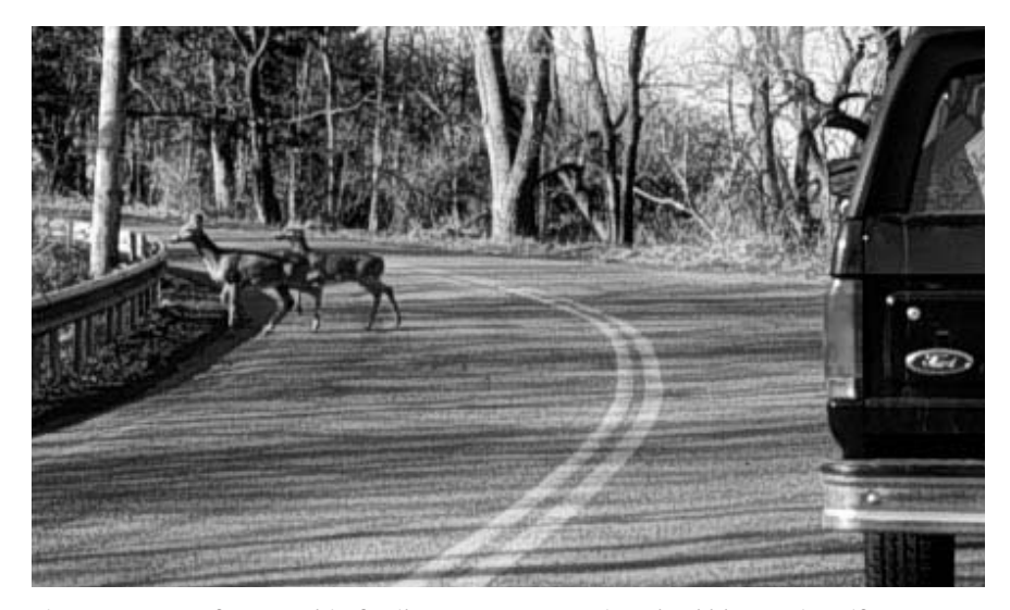
Figure 14. Deer often travel in family groups, so motorists should be cautious if one or more deer are seen on the roadside.

Highway departments install fencing along roadsides for many reasons in addition to preventing deervehicle collisions. The effectiveness of fencing for reducing numbers of deer-related accidents is limited unless properly maintained "deer-proof" fences are installed (Falk et al. 1978, Feldhamer et al. 1986). Romin and Bissonette (1996) reported that only ten states used fencing combined with overpasses/underpasses to lower deer-vehicle accidents, but more than 90 percent of state highway departments indicated fencing was effective for preventing animal-vehicle collisions. A 90 percent reduction in deer-vehicle accidents was achieved along a 7.8-mile section of I-70 in Colorado after the construction of an eight-foot-high deer fence (Ward 1982). Accident rates were also reduced in Minnesota (Ludwig and Bremicker 1983) and Pennsylvania (Faulk et al. 1978, Feldhamer et al. 1986) by constructing "deer-proof" fences. It appears that deer rarely jump nine-foot fencing (Feldhamer et al. 1986). Fencing must be frequently inspected with breaks or erosion gullies quickly repaired, because deer will find gaps or weak points where they can cross (Foster and Humhprey 1995, Ward 1982). Bashore et al. (1985) concluded that fencing was the cheapest and most effective method for reducing deer-vehicle collisions along short stretches of highway.