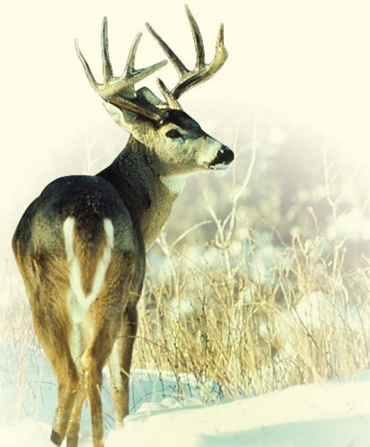
Mixed aspen-balsam fir. Good winter habitat for deer.

A combination of deep snow and cold temperatures over a long period drains a deer's energy. A severe winter often causes malnutrition, and combined with a late spring green-up, may cause starvation and lower fawn production. Periodic severe winters have contributed to fluctuating deer populations in northern Minnesota. Supplemental feeding of deer is not recommended and should not be viewed as a replacement for good habitat.