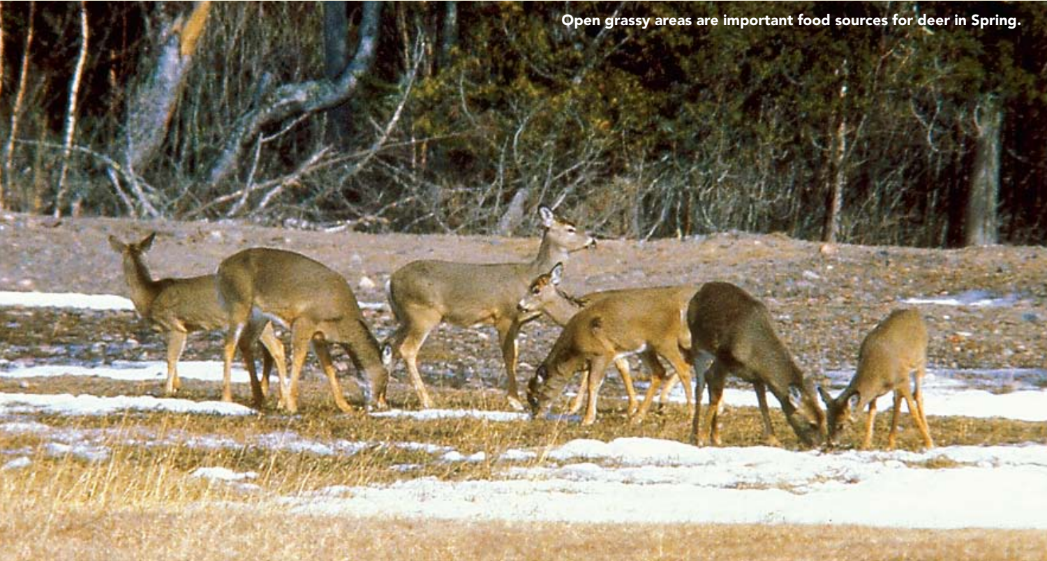
Open grassy areas are important food sources for deer in Spring.

Oak management is influenced by the quality, condition and age of the trees present. The proportion of oak